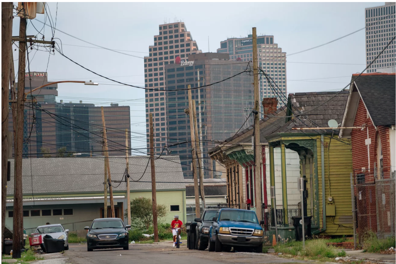
The Entergy building, seen from Magnolia Street in the Central City area of New Orleans.