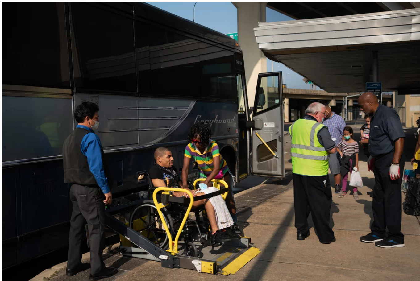
Hollins helps her son as he is lifted into the bus.

"We have been given one option by Entergy: a fossil fuel plant," Guidry said before the vote. "That's the only thing they've analyzed. They haven't analyzed alternatives. They said, 'We don't want to analyze transmission lines and upgrade to alternatives because it would cost too much money.' "