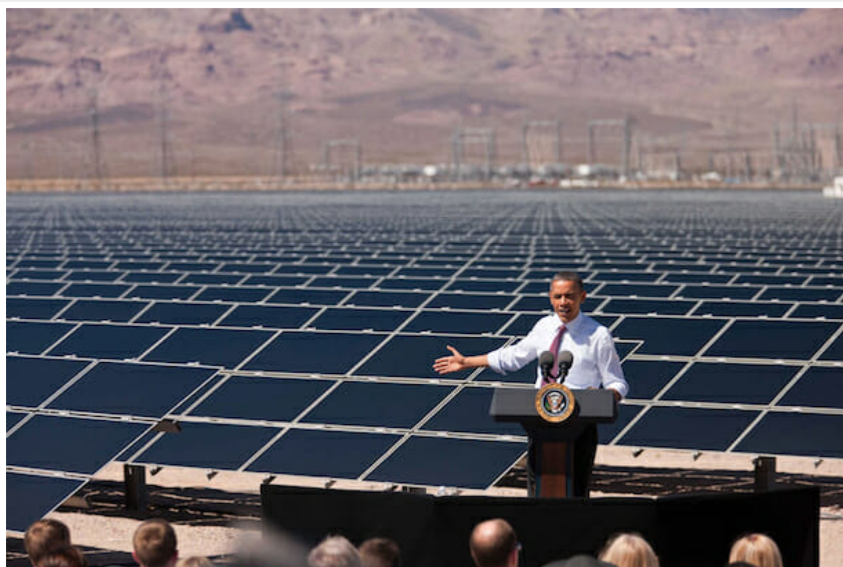
Barack Obama's efforts to push renewables was largely thwarted.

Californians are being "protected" by a racket of regulators in cahoots with the monopoly utility companies.