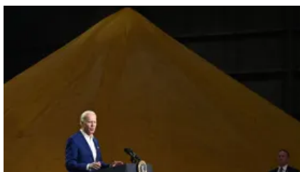
Biden scores points in Midwest with ethanol announcement