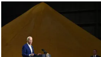
Biden scores points in Midwest with ethanol announcement