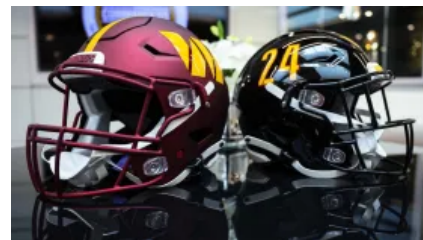
Washington Commanders may have cheated fans, other team owners