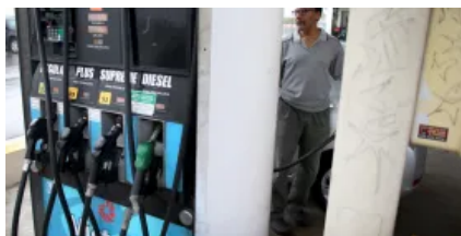
Trump administration lifts summer restrictions on higher-ethanol gasoline