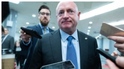
Biden border move opens rift among Senate Democrats