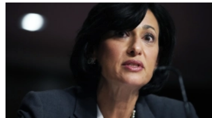
Outlook poses tough questions for next steps on COVID-19 vaccines