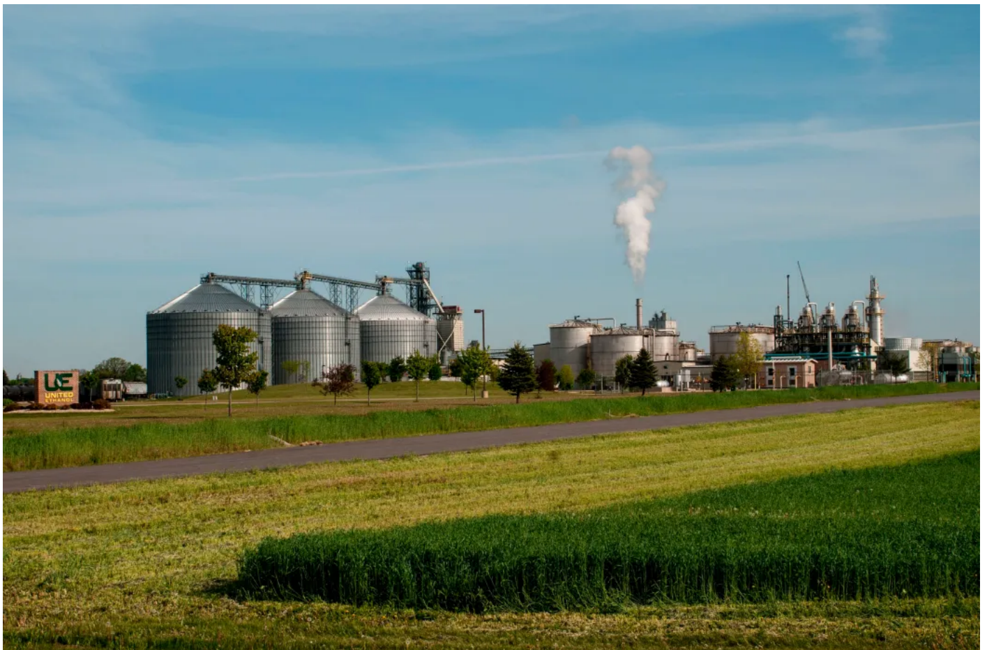
An ethanol plant in Milton, Wis.

Announcement is part of the administration's response to energy market shocks following Russia's invasion of Ukraine