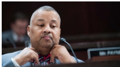
Primary challenger's fundraising spurs NJ Rep. Donald Payne to step up efforts