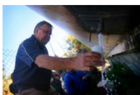
WILDOMAR: Local researchers test water content