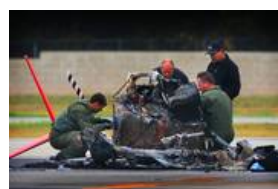
CORONA: Helicopter pilot killed in refueling