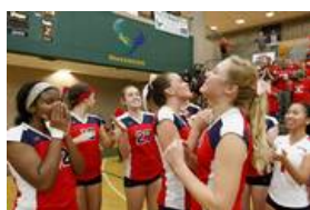
GIRLS VOLLEYBALL: King 3, La Costa