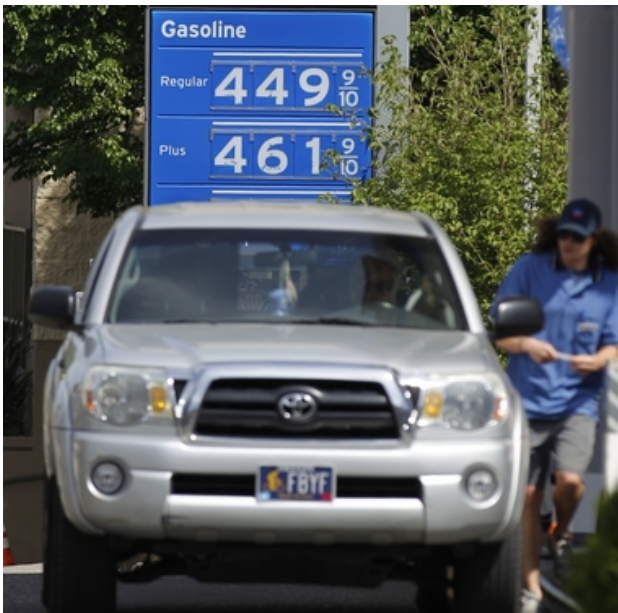
Filling up in Portland last May, at special West Coast prices.